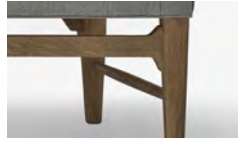
Smoked oiled oak