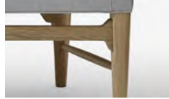
White oiled oak