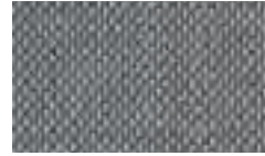
Sunniva 2 242 In stock