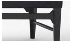
Black lacquered oak