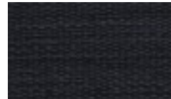
Balder 3 192 In stock

*OTHER FABRICS / LEATHERS AVAILABLE UPON REQUEST. LEADTIME 6-8 WEEKS